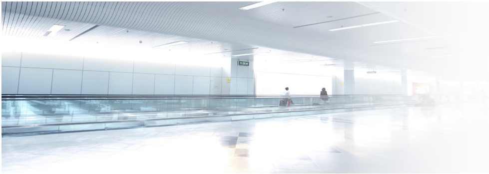
Application illustration only, subject lamps not used in photo.