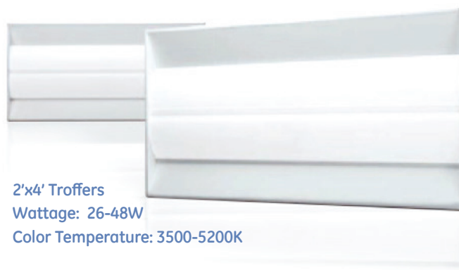
2'x4' Troffers Wattage: 26-48W Color Temperature: 3500-5200K

LG LED troffers serve a variety of applications. Customers can use lensed or architectural units to enhance interior design or to improve lighting conditions for any application. Lumens per watt (efficacy) varies depending on the desired wattage and color temperature of the troffer selected with high efficacy 2'x2' and 2'x4' troffers delivering over 130 lumens per watt.