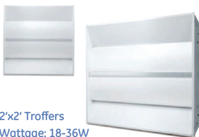
2'x2' Troffers Wattage: 18-36W Color Temperature: 3500-5000K