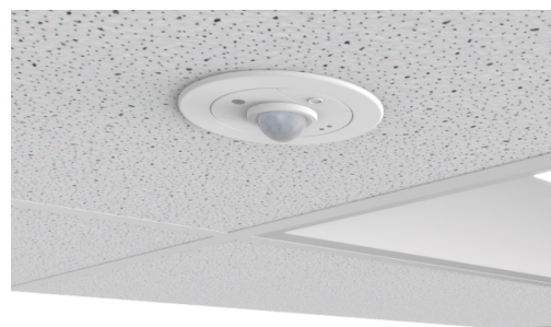
Wireless Occupancy Sensor, Recess Mount (WOS2-RM)