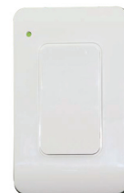
Wireless Wall Dimmer (WWD1)