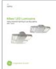
Data Sheet - ALB017