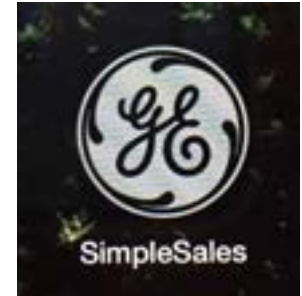
Simple Sales App