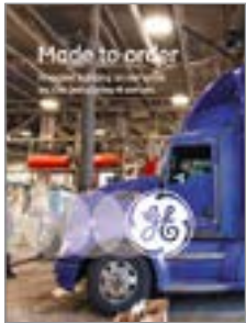
Brochure - VERT036