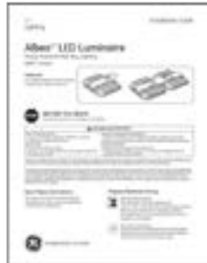
Install Guide - ALB019