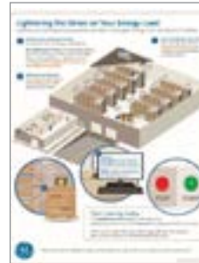
Infographic - 18934