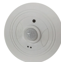
Wireless Occupancy Sensor, Recess Mount (WOS2-RM)